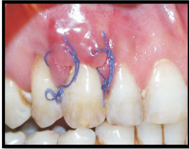
Figure 3(a): 1st month follow up