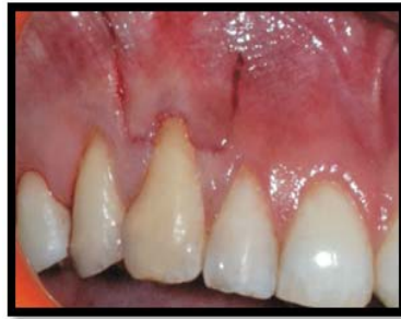
Figure 1(b): Incisions given