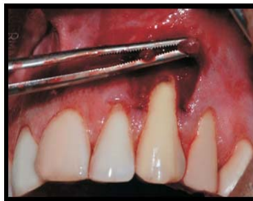
Figure 2(b): Flap reflected