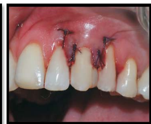
Figure 2(g): Coronal advancement of the flap and secured with sutures.