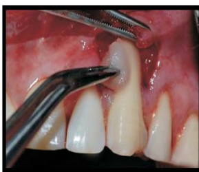
Figure 2(d): Application of 24% EDTA