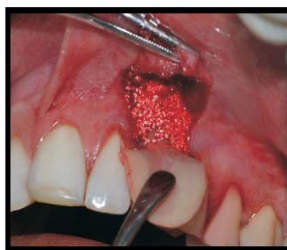
Figure 2(f): Bone graft (Sybograf Plus) placed underneath membrane