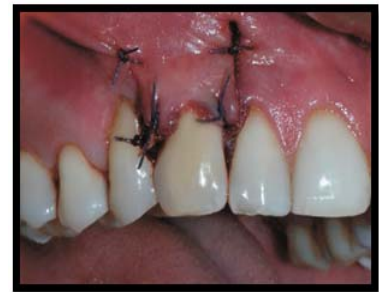
Figure 1(f): Coronal advancement of the flap and secured with sutures.