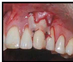
Figure 2(e): Collagen membrane secured with sutures