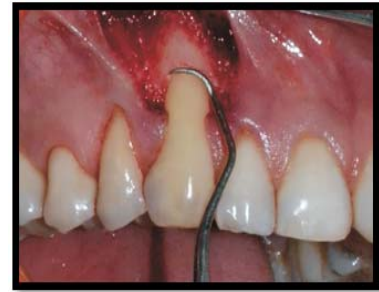
Figure 1(c): Root planning done