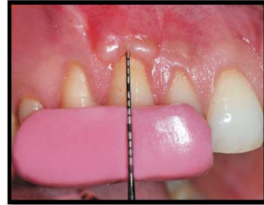
Figure 3(c): Recession Depth at 6 months