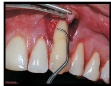
Figure 2(c): Root planing done