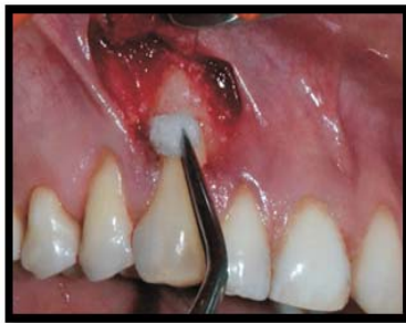
Figure 1(d): Application of 24% EDTA