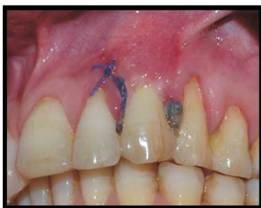
Figure 4(a): 1st month follow up