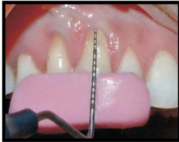
Figure 1(a): Recession Depth at baseline