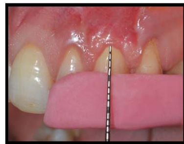
Figure 4(c): Recession Depth at 6 months