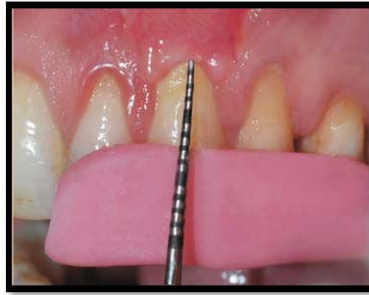
Figure 4(b): Recession Depth at 3 months