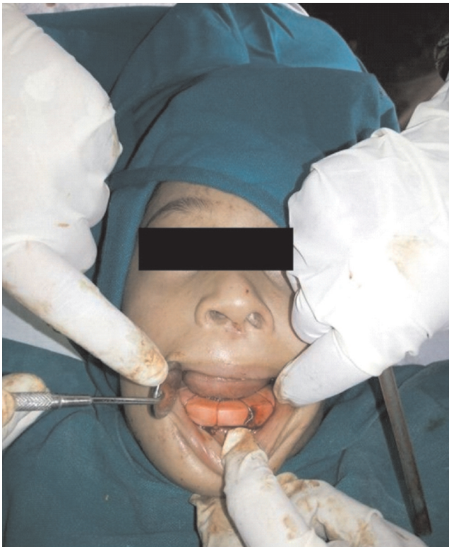
Figure 2: Post operative photograph with positioned splint on mandibular arch

It was decided to reduce the mandible by closed reduction using fabricated acrylic splint followed by circummandibular wiring. Treatment plan was explained to patient's parents and their written informed consent was obtained. The alginate impressions of upper and lower arch were made and working models were prepared. An occlusal acrylic splint was fabricated on the lower cast. After getting the anaesthetic clearance, the patient was prepared for the surgery under conscious sedation. Reduction of the fractured segments was done by bimanual maneuver, followed by fixation of acrylic splint and circummandibular wiring (Figure 2). This was done