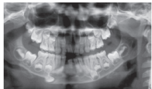
Figure 1: Pre operative Orthopantomograph

was well oriented to time and place after the accident. There was difficulty in opening and closing of mouth. Clinical examination revealed step deformity of the right lower border of the mandible with deviation to right side. The patient had primary dentition. Intraoral examination revealed derangement of occlusion. The fractured segments were not mobile. A hematoma was present on the buccal aspect of right parasymphysis region. Orthopantomograph revealed right parasymphysis mandibular fracture. Radiographic examination revealed discontinuity of the right border of mandible; fracture line was seen running obliquely downward and backward from canine to 1st premolar region. (Figure 1). Blood investigations were carried out and the results were within normal range.