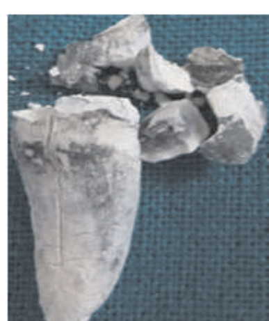
Figure 1: Digital Camera evaluation of the samples at different temperatures