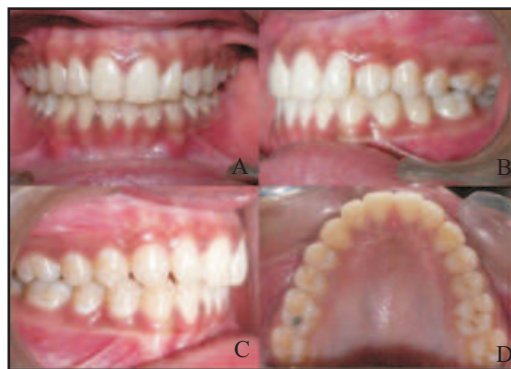
Figure 5(A, B, C, D): Post-treatment