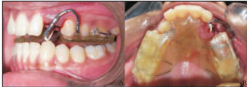
Figure 1 (A, B) : Removable Appliance in place